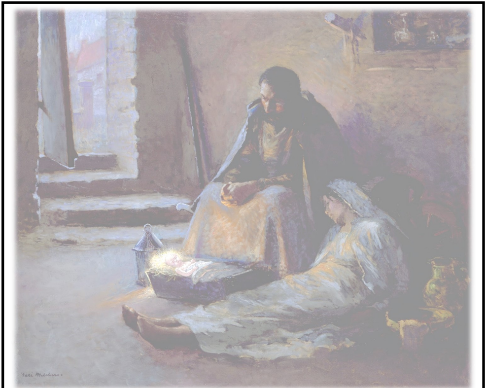
'The Nativity' by Julius Garibaldi Melchers. 1891.

For details of any of the above, contact the Parish Office.